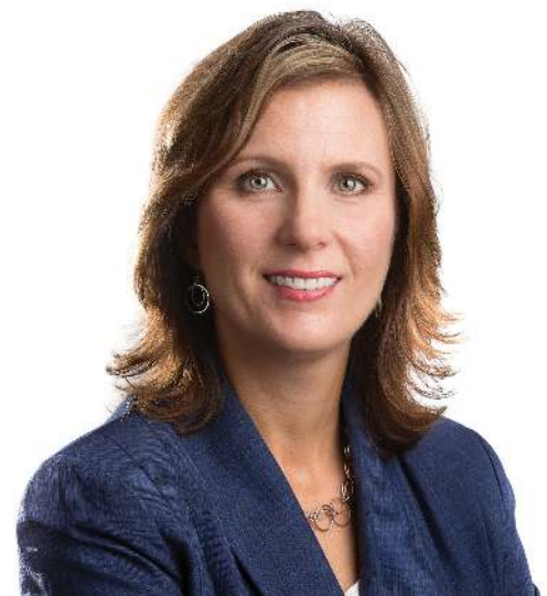
President and CEO State Policy Network